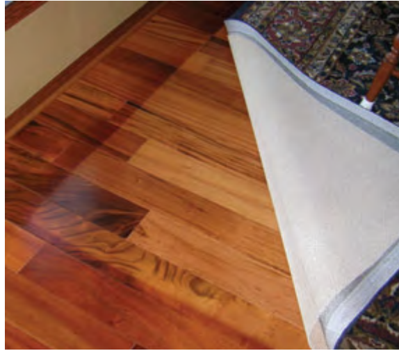
Apply felt to chair legs to protect the floor. Note colour variations where rugs have been covering a timber floor.

Similarly, it should also be ensured that heavy items such as fridges are moved carefully into position and at no time should they be dragged over either newly finished or fully cured floors. Consideration should also be given to chairs with castors as they can indent softer timbers and also cause premature wear of the coatings they are in contact with. Again these should not be used until the finish has hardened. (Note that barrel type castors are less likely to damage a floor than ball castors.) Avoid walking on your wood floors with cleats, sports shoes and high heels. A 60kg woman walking in high heels can have an impact of 1 tonne per square inch. An exposed heel nail can exert up to 4 tonne per square inch. This kind of impact can dent any floor surface.