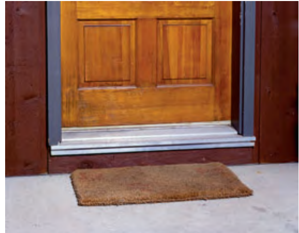
Adding rugs and mats at door entrances and under furniture will assist in protecting your flooring

Another aspect that should be considered is the amount of direct sunlight that is reaching the floor. Direct intense sunlight can contribute to gapping and possible cupping of boards (board edges higher than the centre of the board). It will also cause the colour of both boards and finish to change with time. Some floor finishes are more prone to darken with age and direct sunlight accelerates this process. Filtered sunlight through curtains or blinds provides an effective means of slowing the colour change processes and is also effective in controlling the gap width between and possible cupping of floor boards. In some instances it may be decided that window coverings will not be used, and if the sunlight has not been controlled by patio roofs or awnings then floors rugs can be used.