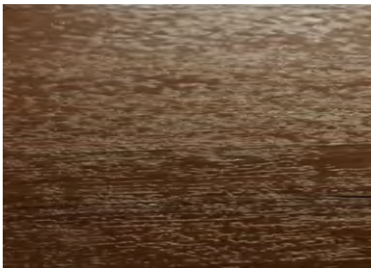
The above photo shows a 2 part water based floor coating after 3 weeks of cleaning with the wrong products.