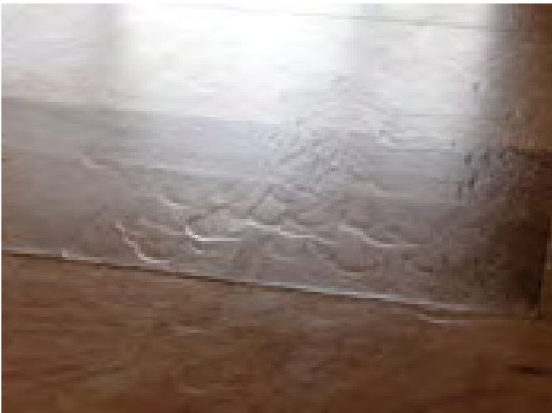
A floor that has not been adequately protected from chair legs.

Similarly, it should also be ensured that heavy items such as fridges are moved carefully into position and at no time should they be dragged over either newly finished or fully cured floors. Consideration should also be given to chairs with castors as they can indent softer timbers and also cause premature wear of the coatings they are in contact with. Again these should not be used until the finish has hardened. (Note that barrel type castors are less likely to damage a floor than ball castors.) Avoid walking on your wood floors with cleats, sports shoes and high heels. A 60kg woman walking in high heels can have an impact of 1 tonne per square inch. An exposed heel nail can exert up to 4 tonne per square inch. This kind of impact can dent any floor surface.