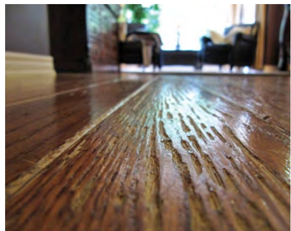
A prefinished timber floor damaged by repeated use of a steam mop cleaner