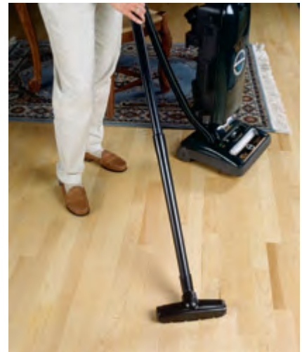
Vacuum frequently with a soft brush head.

On a fortnightly to monthly basis floors can also benefit from damp mopping. Providing the mop is only damp and the finish is in good condition, mopping carried out correctly will not affect either the finish or the timber. Damp mopping provides an effective deep clean and should be undertaken with a neutral pH wood floor cleaner or product recommended by the finish manufacturer. Harsh detergents or abrasive cleaners are to be avoided. After wetting the mop it should be wrung out until it is moist before mopping. Using clean water, a final mopping with a mop wrung out till it is 'dry' may be used to further remove excess moisture on the boards. Periodically the protective pads on furniture legs should also be check to ensure that they are clean of grit or in need of replacement.