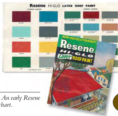
Above: An early Resene colour chart.

To reinforce this position, Resene joined the Environmental Choice programme in 1996, making it easier for consumers to select paints that ease the burden on the environment.