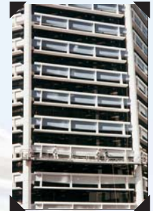
Beware wet paint! Painting in progress.

Written guarantees can be custom-designed for specific projects using Resene paint systems. Guarantees that apply to a particular system can be confirmed at the time the project specification is written. The warranty terms must be agreed in writing prior to the application of the paint system.