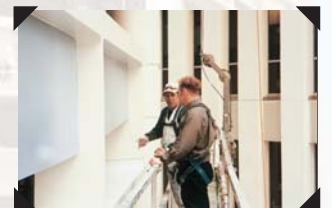
Site visit to check job against guarantee.

The total project, consisting of a full exterior repaint of the twelve storeys took approximately seven weeks from the initial planning phase through to the final coat of paint on the exterior envelope. The building was fully tenanted throughout the project putting extra pressure on the painting contractor to minimise disruption to tenants.