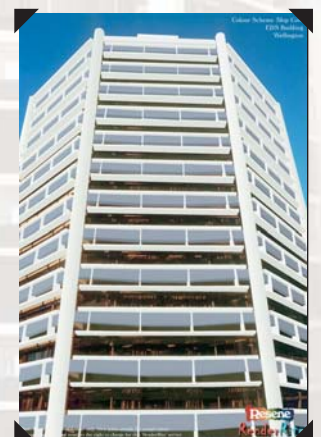
Confirming the colour scheme with RenderRite - this is what the finished project should look like.