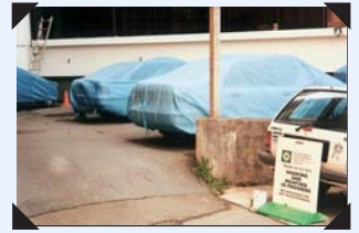
Managing the site to minimise disruption to tenants.

The human eye is capable of seeing millions of colours, meaning that there are few limits when it comes to selecting colour schemes. The assistance of Resene staff trained in the use of colour and familiar with Resene colours and colour tools can provide a welcome unbiased second opinion to simplify the colour scheme development process.