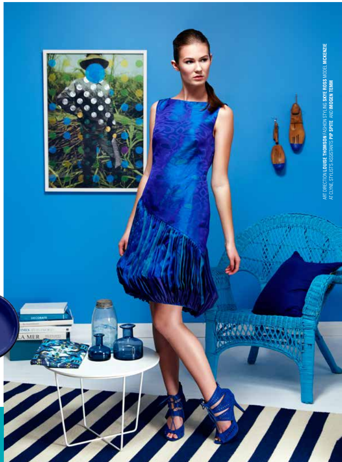
ART DIRECTION LOUISE THOMSON FASHION STYLING SWE ROSS MODEL MCKENZIE AT CLIVE, STYLISTS ASSISTANTS PIP SPITE AND IMOGEN TEMMI

Resene Deep Koamaru was the paint colour behind 20-year-old Mary Nguyen's design, a dramatic creation with strong Pacific ocean influences. Blue is also a clever choice when it comes to interior decorating, as it is a colour that can work in every room of your home. Depending on the shade of blue you choose - and the possibilities are endless - you can give the illusion that a space is larger or smaller than it is. Hues like cobalt, turquoise and ice blue have yellow in them, helping the painted area recede - and this makes your room look bigger. Tones of denim, ocean or slate blue, which have red in them, will do the opposite, allowing a space to feel cosy. Blue is said to promote a feeling of calm but also of focus, making it a good choice in areas like a home office.