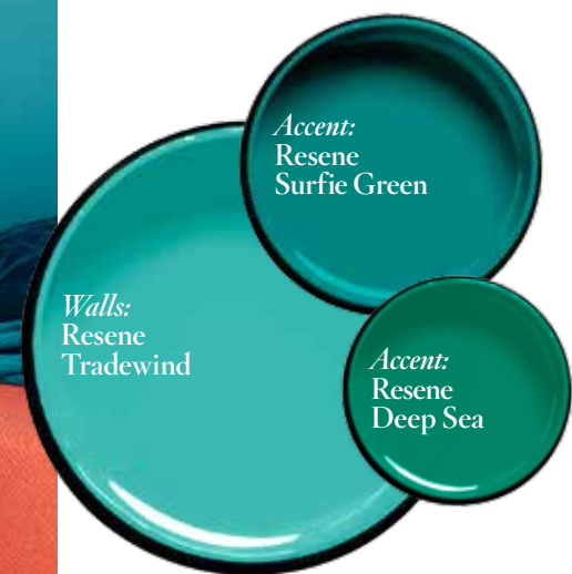
WALL COLOUR IN RESENE 'TRADEWIND', CHAIR FROM JUNK AND DISORDERLY IN RESENE 'SURFIE GREEN', SHELVES IN RESENE 'DEEP SEA', FLOOR AND SKIRTING IN RESENE 'ALABASTER', 'TIME GOING BACKWARDS WITH ASSISTANCE', AND 'PROUN FOR THE REGENERATION OF MINDS' MIXED MEDIA ON INKJET PRINT, BOTH BY LIYEN CHONG, $2950 EACH, COURTESY OF MELANIE ROGER GALLERY. GREEN PHONE, $199; AND SMALL BLUE LEON BOOK, $18; BOTH FROM MACY HOME. DAN 300 CUSHION (ON CHAIR), $110; AND ALL OTHER BOOKS FROM COLLECTED. HAY DESKTOP BOX BOXES, $121 SET, AND HAY FEATHER PENS, $16; BOTH FROM CULT. LADYLIKE BLUE BAG, $99; AND PURSE MIGHTY, $140, BOTH FROM REDCURRENT. BLUE NF VASE, $75; BLUE NF JUG, $33; CAM PARROT, $89; BLUE OTTOMAN POUFFE, $699; TURKISH BEACH TOWEL, $269; AND BLUE VELVET MULBERI CUSHION, $79; ALL FROM REPUBLIC. HEX OTTOMAN BY SIMON JAMES, FROM $690, FROM SIMON JAMES DESIGN. 'ARMADILLO&CO' TEAL PILGRIM RUG, $1254, FROM THE IVY HOUSE. SMALL GREEN VASES AND STRIPEY CUSHION, STYLIST'S OWN. SHOES, $159, FROM MAX. BELT, $25, FROM PORTMANS.

Contrast with Resene Scandal to add lightness and Resene Blackcurrant for a dash of drama.