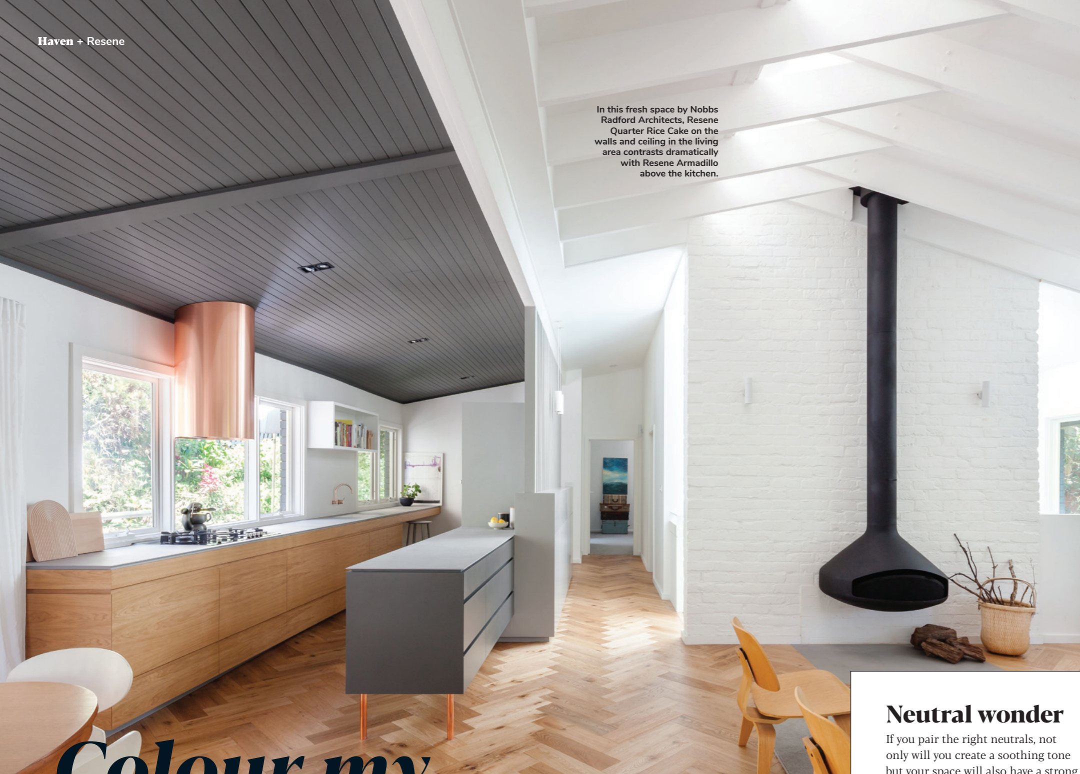
In this fresh space by Nobbs Radford Architects, Resene Quarter Rice Cake on the walls and ceiling in the living area contrasts dramatically with Resene Armadillo above the kitchen.