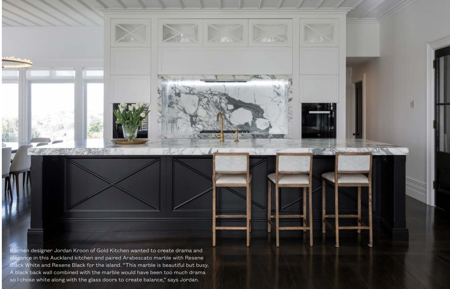
Kitchen designer Jordan Kroon of Gold Kitchen wanted to create drama and elegance in this Auckland kitchen and paired Arabescato marble with Resene Black White and Resene Black for the island. "This marble is beautiful but busy. A black back wall combined with the marble would have been too much drama so I chose white along with the glass doors to create balance," says Jordan.