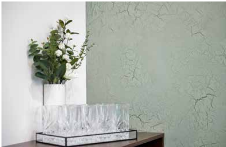
above: Resene FX Crackle was used to create a bespoke paint effect (right wall) for a commercial office space in Newstead. Resene Rivergum was used for the basecoat, followed by a coat of Resene FX Crackle and lastly a topcoat in Resene Field Day. Ceiling and adjacent walls painted in Resene SpaceCote Low Sheen tinted to Resene Black White. Design, fit-out and images by Urban Group ( www.urban-group.com.au ).

Resene FX Crackle is another interesting option for creating an aged effect. Depending on your Resene colour choices and the order you apply them, the combinations for a distinctive crackle finish are virtually limitless. Before applying Resene FX Crackle, you can apply two or more basecoats in a single colour tinted into an acrylic formula such as Resene Lumbersider Low Sheen or Resene Zylone Sheen. For a more unique effect, Resene FX Paint Effects Medium mixed with one or more other Resene colours can also be brushed or wiped on prior to applying your Resene FX Crackle coat. After applying Resene FX Crackle, a final coat of an acrylic topcoat tinted to a Resene colour that contrasts with your basecoats gets applied. Then, the Resene FX Crackle coat will shrink, causing your acrylic topcoat to crack and reveal the basecoat colours beneath.